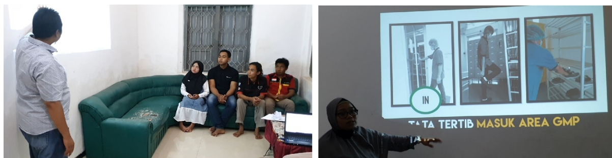
Figure 2. Delivering Process material Aspect of GMP Standard

This training activity was attended by 30 participants include owner and employees and was held on February 2020 after preparation activity. During training activities of standard GMP Processing units, participants was very enthusiastic in following and listening the explanations. Delivering material of GMP standart can be seen on figure 2.