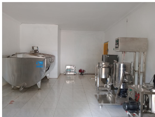
Figure 5. processing room shows

GMP Aspects in production process unit. It indicates that CV Indo Dairy Milk, Kaligondo Village has started to implement GMP principle in their processing unit product to increasing quality of their products.