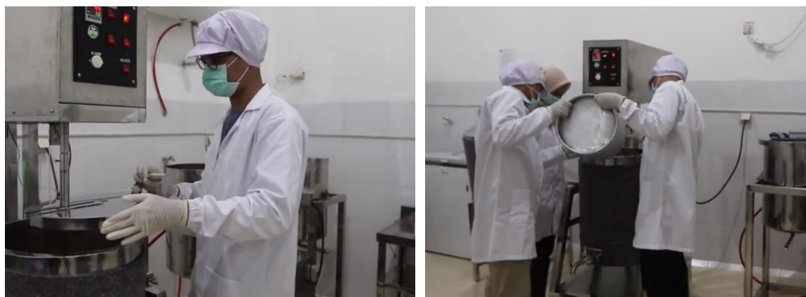
Figur 3. Personal Hygiene Aspect of GMP on Processing Unit

From the aspect of the pest control system, it also shows an increase, where before the application the value is 60.0 after implementation becomes 85.0. Pest control system aspects are also a concern for improvement because frequent contamination caused by pests that enter the production room. It is necessary to take the minimum possible steps that already exist in the requirements of the pest control system to prevent this by providing given the seal of PVC plastic curtain between space production (Shows in Figure 4) and providing a cover on each of the existing air net vents.