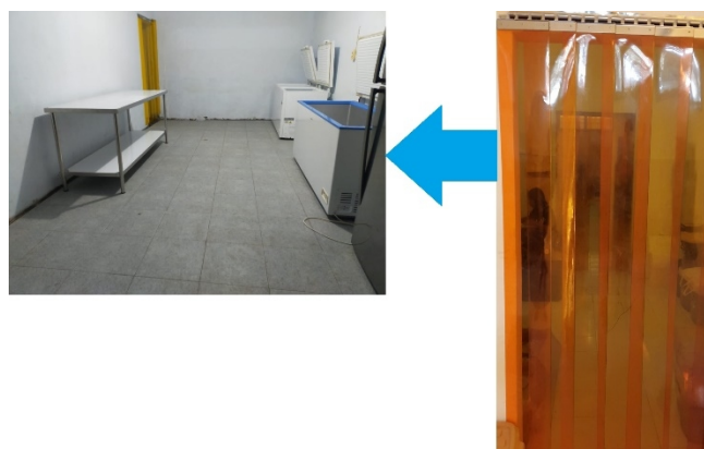
Figure 4. Seal of PVC plastic curtain between space production

From the aspect of the pest control system, it also shows an increase, where before the application the value is 60.0 after implementation becomes 85.0. Pest control system aspects are also a concern for improvement because frequent contamination caused by pests that enter the production room. It is necessary to take the minimum possible steps that already exist in the requirements of the pest control system to prevent this by providing given the seal of PVC plastic curtain between space production (Shows in Figure 4) and providing a cover on each of the existing air net vents.