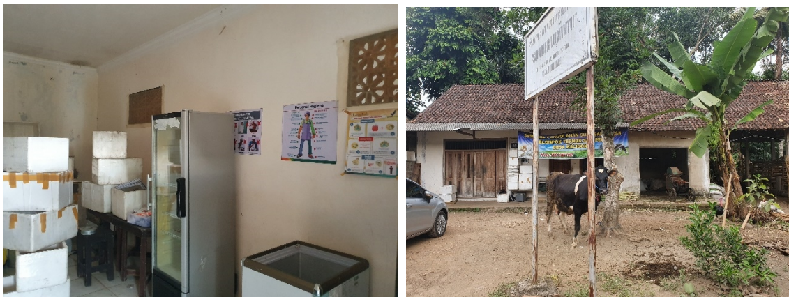
Figure 1. Collecting Data in CV Indo Dairy Milk Kaligondo Village

Target from Data collection activity are to know members of CV Indo Dairy Milk in GMP processing products and apply it to respective processing units based on check list of ratings aspects of GMP through direct observation before and after GMP application. This survey data / data collection (preparation) was held on February 2020.